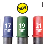
Snap-on WO:SIMMF3SET Thin Wall Non-Scuff Sockets