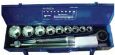
Blue-Point ETRM713MBA OR SAME SET AVAILABLE IN FOAM MOD.192SH42D

13pc Set in Steel Container consists of the following: