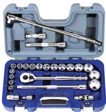
Blue-Point BLPGSSM1225 MM 25pc General Service Set in Moulded Plastic Container

Set Includes: BLPSM1210-32: 17x 6pt Shallow Sockets; 10 - 22, 24, 27, 30 & 32mm BPRSR940: Quick Release Ratchet BLPBB1215: Breaker Bar 15" BLPEXTK1210: Extension 10" BLPEXTK126: Extension 6" BLPEXTK123: Extension 3" BLPUJ12: 1x Universal Joint 2x Adapters 1/2" - 3/8" & 1/2" - 3/4" Also in: MOD.436SH45S