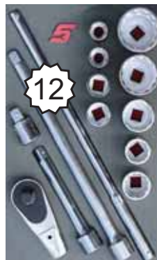
Snap-on Equivalent MOD.384SH42D 13pc Ratchet & Extension Set in foam