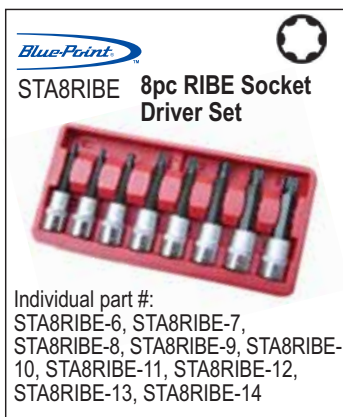
Blue-Point STA8RIBE 8pc RIBE Socket Driver Set

Set Includes: 1/2" Sizes 10, 12, 14, 17 & 19mm, 7/16", 1/2", 9/16", 5/8" & 3/4" 1/4" Sizes 2.5, 3, 4, 5 & 6mm, 1/8", 9/64", 5/32", 3/16", 7/32" & 1/4" 3/8" Sizes 6, 7, 8, 9 & 10mm, 7/32", 1/4", 5/16" & 3/8" Also in: MOD.703SH45SC