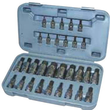
Blue-Point MM II BLPHSSC30 30pc Metric & Imperial Allen Key Socket Set in Moulded Plastic Container

Also in: MOD.364SH45S, MOD.703SH45SC MOD.715SH45S14