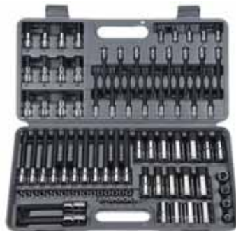
Blue-Point BLPTH87 87pc Torx Hex Bit Drive Set

Set Includes: BLPSM1210-32: 17x 6pt Shallow Sockets; 10 - 22, 24, 27, 30 & 32mm BPRSR940: Quick Release Ratchet BLPBB1215: Breaker Bar 15" BLPEXTK1210: Extension 10" BLPEXTK126: Extension 6" BLPEXTK123: Extension 3" BLPUJ12: 1x Universal Joint 2x Adapters 1/2" - 3/8" & 1/2" - 3/4" Also in: MOD.436SH45S