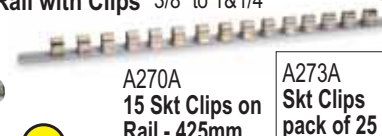
A270A 15 Skt Clips on Rail - 425mm