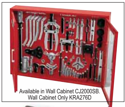
Available in Wall Cabinet CJ2000SB. Wall Cabinet Only KRA276D